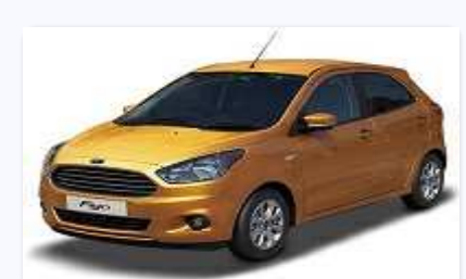
Ford Figo 1.2p Titanium Mt

68,112 Km, Petrol, First Owner, Jaipur, 2010