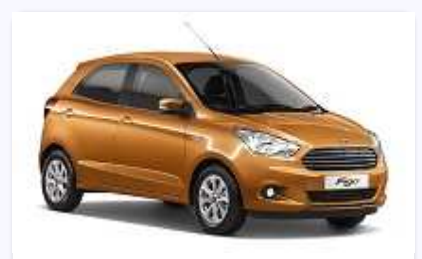
Ford Figo 1.2p Titanium Mt