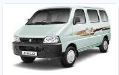
Maruti Suzuki Eeco 5 Str Ac used ₹3,00,000 70,000 Km, Petrol, First Owner, Nashik, 2011