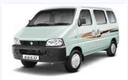
Maruti Suzuki Eeco 5 Str ₹ 1,66,000 50,000 Km, Petrol, First Owner, Delhi, 2014