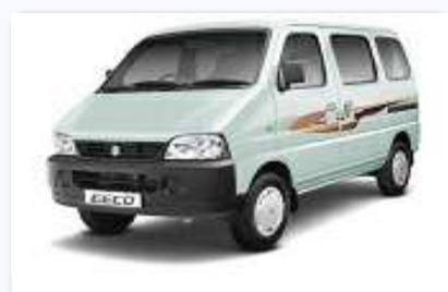
Maruti Suzuki Eeco 5 Str Ac Cng used ₹ 2,25,600 99,000 Km, Petrol + CNG, Second Owner, Delhi, 2016