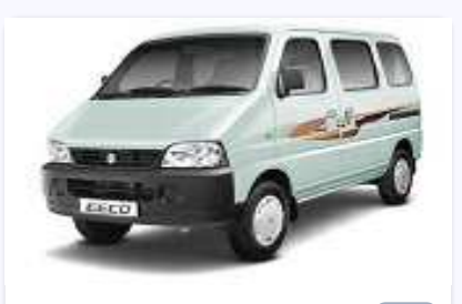
Maruti Suzuki Eeco 7 Str used ₹3,10,000 76,000 Km, Petrol, First Owner, Kanchipuram, 2010