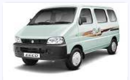
Maruti Suzuki Eeco 5 Str Ac Cng used ₹ 1,58,000 25,000 Km, Petrol + CNG, First Owner, Delhi, 2011