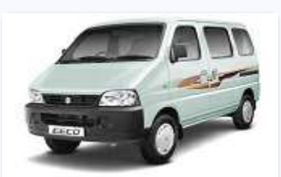
Maruti Suzuki Eeco 5 Str Ac used ₹ 3,00,000 50,000 Km, Petrol, First Owner, Delhi, 2018

Maruti Suzuki Eeco 5 Str Ac used ₹ 1,70,500 20,000 Km, Petrol, First Owner, Delhi, 2013