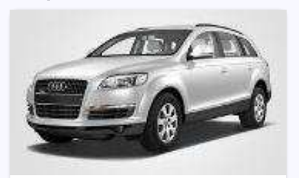
Audi Q7 4.2 Fsi Quattro ₹14,90,000

87,154 Km, Petrol, First Owner, Ludhiana, 2007