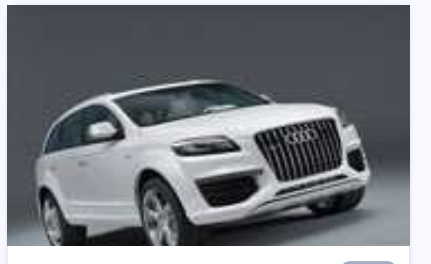
Audi Q7 4.2 Tdi Technology ₹29,00,000

76,461 Km, Diesel, First Owner, Ludhiana, 2010