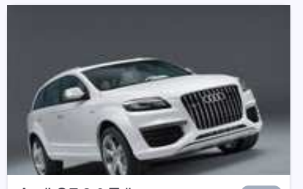
Audi Q7 3.0 Tdi ₹ 17,00,000

30,000 Km, Diesel, First Owner, Beed, 2009