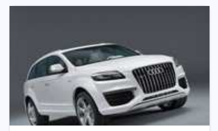
Audi Q7 3.0 Tdi ₹15,40,000

98,000 Km, Diesel, First Owner, Jodhpur, 2008