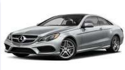
Mercedes-benz E-class E 200 Kompressor

59,000 Km, Petrol, First Owner, Delhi, 2006