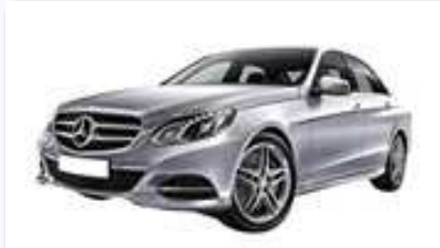
Mercedes-benz E-class E 350 Cdi Avantgarde

78,000 Km, Petrol, First Owner, Mumbai, 2008