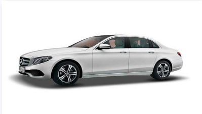
Mercedes-benz E-class 280 Cdi

52,000 Km, Diesel, Second Owner, Mumbai, 2009