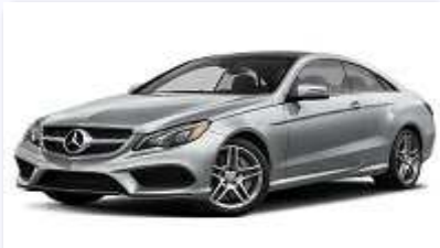
Mercedes-benz E-class E 350 Cgi Avantgarde

50,000 Km, Petrol, First Owner, Delhi, 2010