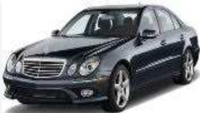
Mercedes-benz E-class 240 V6 At