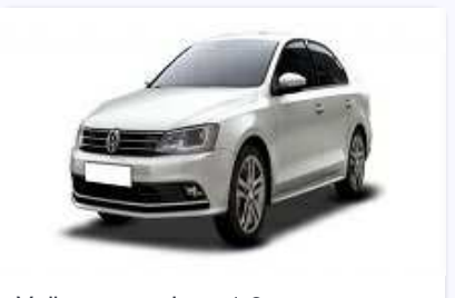
Volkswagen Jetta 1.9 Highline Tdi

80,000 Km, Diesel, Second Owner, Bangalore, 2010