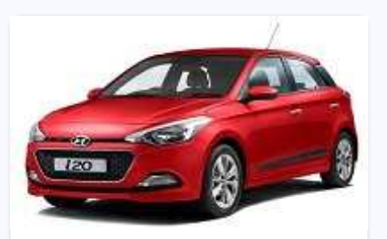
Hyundai Elite I20 Asta 1.4 Crdi ₹4,30,000 35,000 Km, Diesel, First Owner,