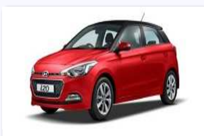
Hyundai Elite I20 Asta 1.2 Opt ₹7,50,000 5,500 Km, Petrol, First Owner, Mumbai, 2019