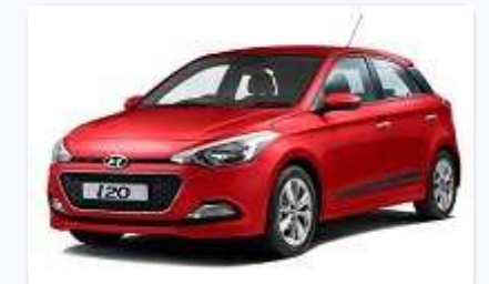
Hyundai Elite I20 Asta 1.4 Crdi ₹3,95,000 65,000 Km, Diesel, First Owner, Jodhpur, 2014