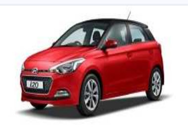
Hyundai Elite I20 Asta 1.2 At used ₹6,96,000 37,000 Km, Petrol, First Owner, Bhiwani, 2018