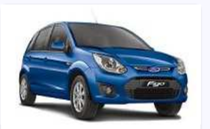
Ford Figo Zxi Duratec 1.2 ₹ 2,60,000

89,000 Km, Diesel, First Owner, Pune, 2010