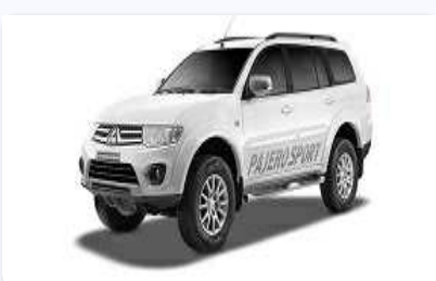
Mitsubishi Pajero Sport 2.5

62,000 Km, Diesel, First Owner, Karnal, 2012