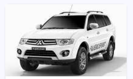
Mitsubishi Pajero Sport 2.5

67,000 Km, Diesel, First Owner, Delhi, 2012