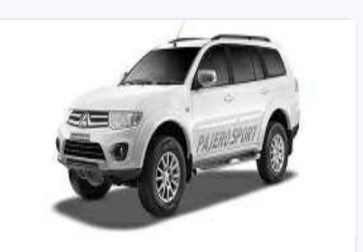
Mitsubishi Pajero Sport 2.8 Sfx Bsiii Dual Tone

58,000 Km, Diesel, First Owner, Saran, 2014