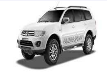
Mitsubishi Pajero Sport 2.5

59,000 Km, Diesel, First Owner, Saran, 2013