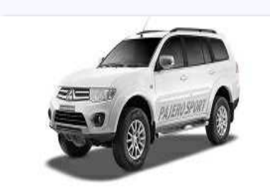
Mitsubishi Pajero Sport 2.8 Sfx Bsiv Dual Tone

68,000 Km, Diesel, First Owner, Pune, 2011