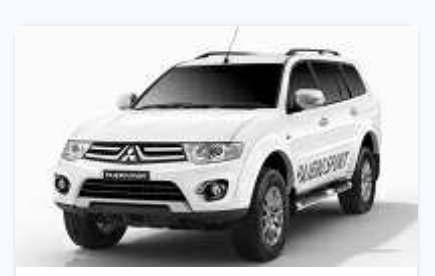
Mitsubishi Pajero Sport 2.5 Mt

54,000 Km, Diesel, First Owner, Saran, 2012