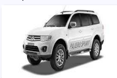
Mitsubishi Pajero Sport 2.5