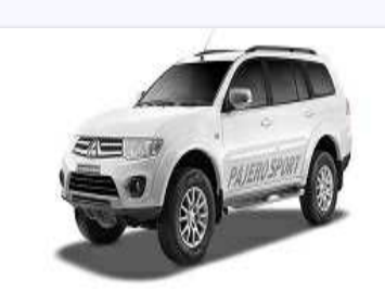
Mitsubishi Pajero Sport 4x2

67,000 Km, Diesel, First Owner, Delhi. 2012