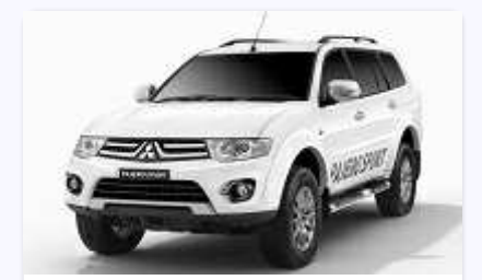
Mitsubishi Pajero Sport 2.5

1,02,369 Km, Diesel, First Owner, Delhi, 2012