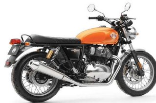
Royal Enfield Interceptor 650cc

19,000 Km, Petrol, First Owner, Adalaj, 2019