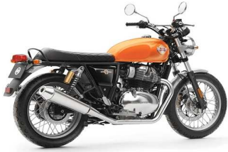
Royal Enfield Interceptor 650cc