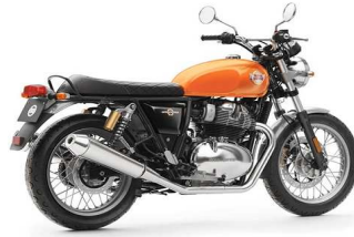
Royal Enfield Interceptor 650cc

20,000 Km, Petrol, First Owner, Mumbai, 2019