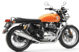
Royal Enfield Interceptor 650cc

16,000 Km, Petrol, First Owner, Mumbai, 2019