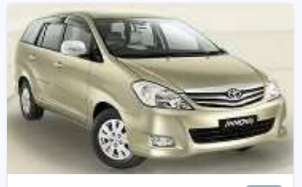
Toyota Innova 2.0 Vx

1,49,000 Km, Diesel, First Owner, Mumbai, 2005