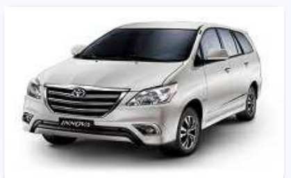
Toyota Innova 2.5 G 8 Str Bs

1,00,000 Km, Diesel, First Owner, Ahmedabad, 2005