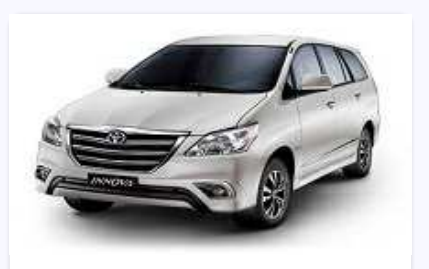
Toyota Innova 2.5 G

1,45,000 Km, Diesel, Fourth Owner, Mumbai, 2005