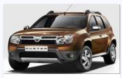
Renault Duster 110 Ps Rxz