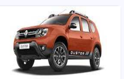
Renault Duster 110 Ps RxI ₹5,51,000

23,000 Km, Diesel, First Owner, Ambala, 2014