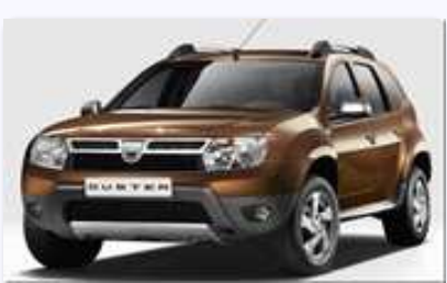
Renault Duster 110 Ps RxI

96,000 Km, Diesel, First Owner, Hyderabad, 2012