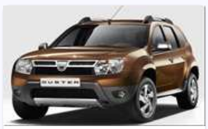
Renault Duster 85 Ps RxI ₹3,99,000

53,000 Km, Diesel, First Owner, Delhi, 2012