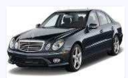
Mercedes-benz E-class E 220 Cdi Elegance

51,000 Km, Petrol, Second Owner, Delhi, 2009