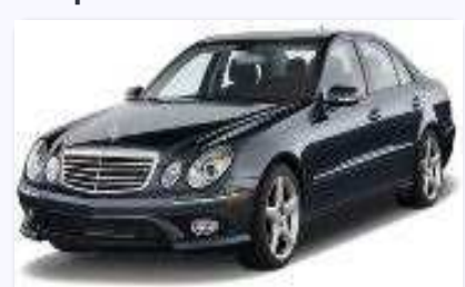
Mercedes-benz E-class 240 V6 At