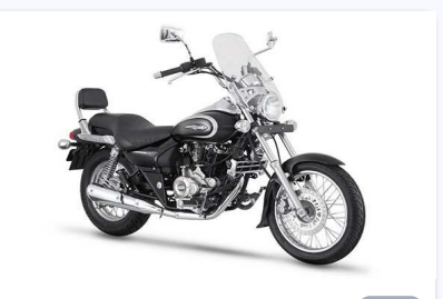
Bajaj Avenger 220cc

26,484 Km, Petrol, First Owner, Ahmedabad, 2010