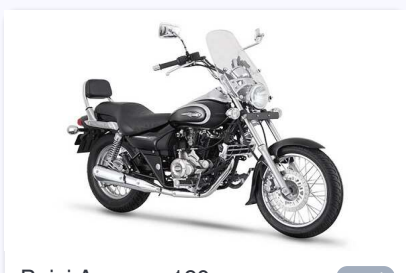
Bajaj Avenger 180cc