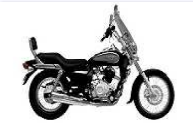
Bajaj Avenger 200cc