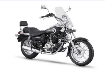
Bajaj Avenger 220cc

28,658 Km, Petrol, First Owner, Ahmedabad, 2012