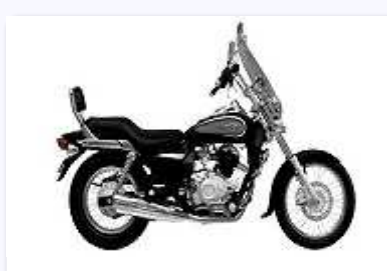
Bajaj Avenger 200cc