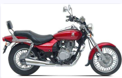
Bajaj Avenger 180cc