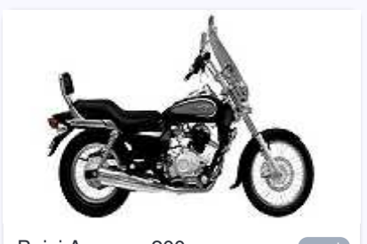
Bajaj Avenger 200cc