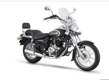
Bajaj Avenger 200cc

68,000 Km, Petrol, First Owner, Jaipur, 2008