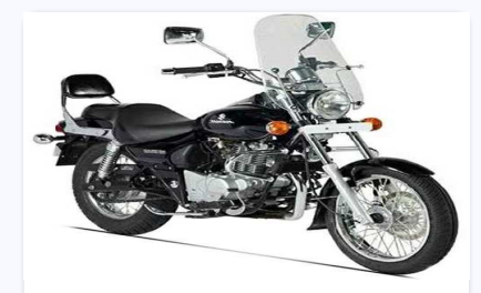
Bajaj Avenger 220cc

1,300 Km, Petrol, First Owner, Ajmer, 2010