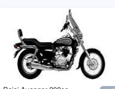
Bajaj Avenger 200cc

98,000 Km, Petrol, Second Owner, Nadbai, 2010