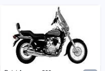
Bajaj Avenger 200cc