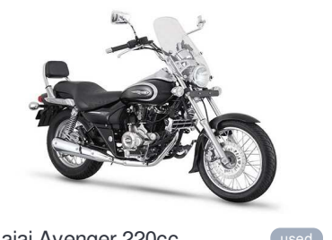
Bajaj Avenger 220cc

42,257 Km, Petrol, First Owner, Delhi, 2012