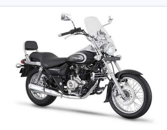
Bajaj Avenger 220cc

55,000 Km, Petrol, First Owner, Delhi, 2012