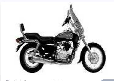
Bajaj Avenger 200cc