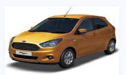
Ford Figo 1.4 Tdci Zxi ₹ 1,81,000 50,000 Km, Diesel, First Owner, Jaipur, 2010