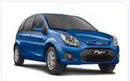
Ford Figo Exi Duratec 1.2 ₹ 1,05,000 70,000 Km, Petrol, First Owner, Kolkata, 2010