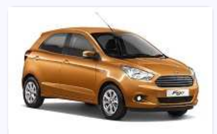
Ford Figo 1.5 Tdci Titanium used ₹5,34,400 52,114 Km, Diesel, First Owner, Ahmedabad, 2019