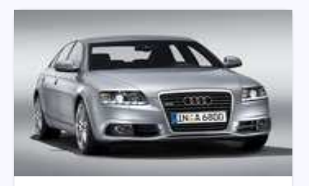
Audi A6 2.7 Tdi

3,000 Km, Diesel, First Owner, Jaipur, 2010