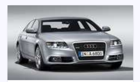
Audi A6 2.7 Tdi

3,000 Km, Diesel, First Owner, Julana, 2008