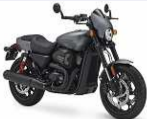
Harley-davidson Street Rod 750cc

13,000 Km, Petrol, Second Owner, Tiruvallur, 2019