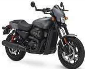
Harley-davidson Street Rod 750cc

9,000 Km, Petrol, First Owner, Delhi, 2017