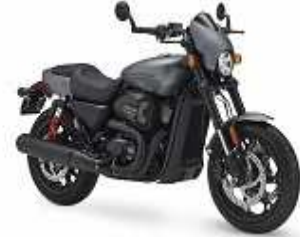
Harley-davidson Street Rod 750cc

17,900 Km, Petrol, First Owner, Delhi, 2017