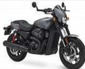
Harley-davidson Street Rod 750cc

4,000 Km, Petrol, First Owner, Delhi, 2019