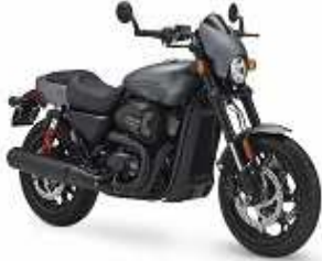
Harley-davidson Street Rod Xg750a Abs