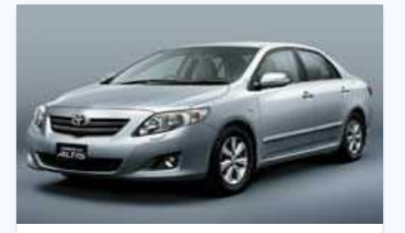
Toyota Corolla Altis 1.8 J ₹ 1,98,000 98,000 Km, Petrol, Second Owner, Hoshiarpur, 2008