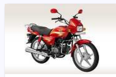
Hero Splendor Plus Ibs I3s Bs6 used ₹ 67,260 -1 Km, Petrol, , Delhi, 2021