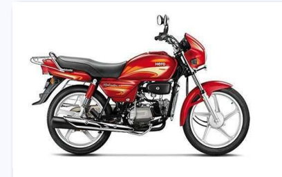
Hero Splendor Plus 100cc ₹ 14,200 82,000 Km, Petrol, First Owner, , 2009