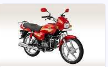
Hero Splendor Plus 100cc used ₹27,600 54,648 Km, Petrol, First Owner, Ahmedabad, 2014