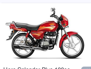
Hero Splendor Plus 100cc ₹ 23,500 34,899 Km, Petrol, First Owner, Ahmedabad, 2009