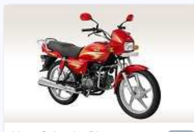
Hero Splendor Plus 100cc used ₹54,000 23,450 Km, Petrol, First Owner, Ahmedabad, 2019