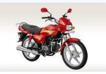
Hero Splendor Plus 100cc used ₹54,000 23,649 Km, Petrol, First Owner, Ahmedabad, 2019