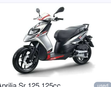
Aprilia Sr 125 125cc ₹ 90,000 5,614 Km, Petrol, First Owner, Kolhapur, 2020