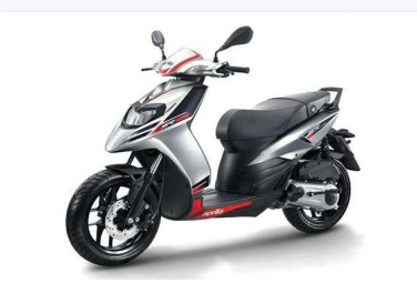
Aprilia Sr 125 125cc used ₹55,000 2,300 Km, Petrol, First Owner, , 2020