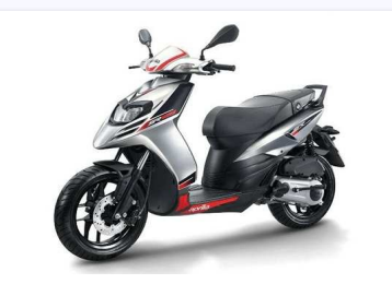
Aprilia Sr 125 125cc Storm used ₹ 60,000 19,500 Km, Petrol, First Owner, , 2019