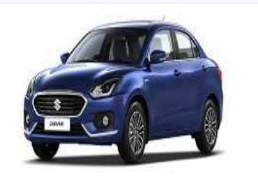
Maruti Suzuki Dzire Ldi ₹6,00,000 25,366 Km, Diesel, First Owner, Ludhiana, 2019