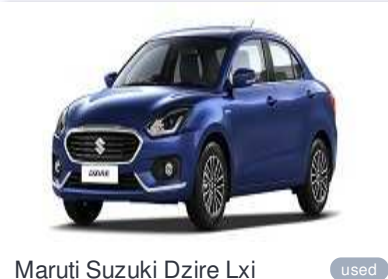
Maruti Suzuki Dzire Lxi ₹4,81,000 39,655 Km, Petrol, First Owner, Delhi, 2019