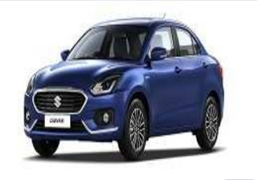
Maruti Suzuki Dzire Lxi used ₹4,40,000 11,000 Km, Petrol, First Owner, Delhi, 2018