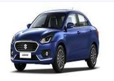
Maruti Suzuki Dzire Lxi used ₹4,35,000 62,000 Km, Petrol, First Owner, Delhi, 2017