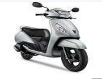
Tvs Jupiter 110cc ₹25,000 18,542 Km, Petrol, First Owner, Ahmedabad, 2014