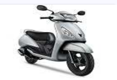
Tvs Jupiter 110cc ₹27,000 24,531 Km, Petrol, First Owner, Ahmedabad, 2014