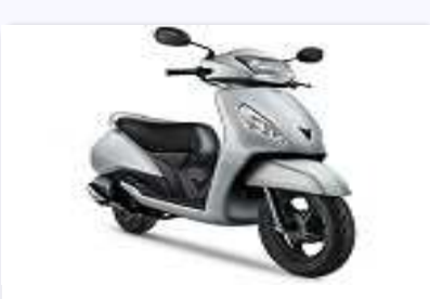
Tvs Jupiter 110cc used ₹30,000 19,545 Km, Petrol, First Owner, Ahmedabad, 2015