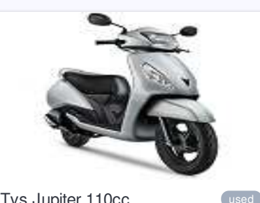
Tvs Jupiter 110cc ₹26,000 52,498 Km, Petrol, First Owner, Ahmedabad, 2014