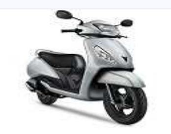
Tvs Jupiter 110cc ₹26,200 26,578 Km, Petrol, First Owner, Ahmedabad, 2014