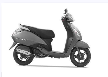
Tvs Jupiter 110cc used ₹27,000 24,531 Km, Petrol, First Owner, Ahmedabad, 2014