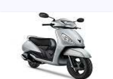
Tvs Jupiter 110cc ₹26,000 9,906 Km, Petrol, First Owner, Ludhiana, 2014