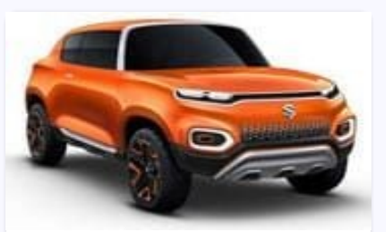
Maruti Suzuki S-presso Vxi Plus Bs6

1,200 Km, Petrol, First Owner, Palanpur, 2019