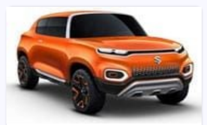
Maruti Suzuki S-presso Vxi Bs6

1,500 Km, Petrol, First Owner, Balotra, 2020