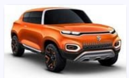
Maruti Suzuki S-presso Vxi Bs6