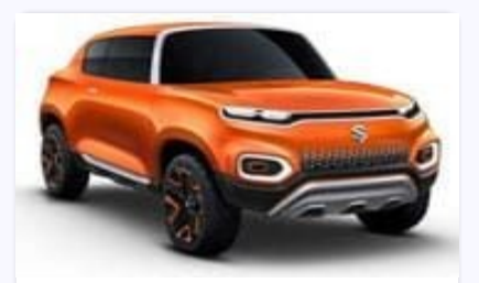
Maruti Suzuki S-presso Lxi (o) Bs6

25,000 Km, Petrol, First Owner, Guwahati, 2019