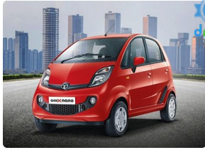
Tata Nano Genx

Assessment Of Comparable Vehicles Key Features And Performance