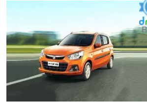
Maruti Suzuki Alto K10